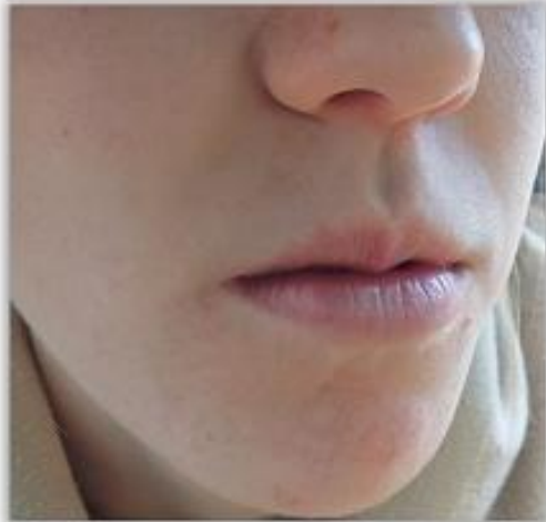
Junie 2024–September 2024