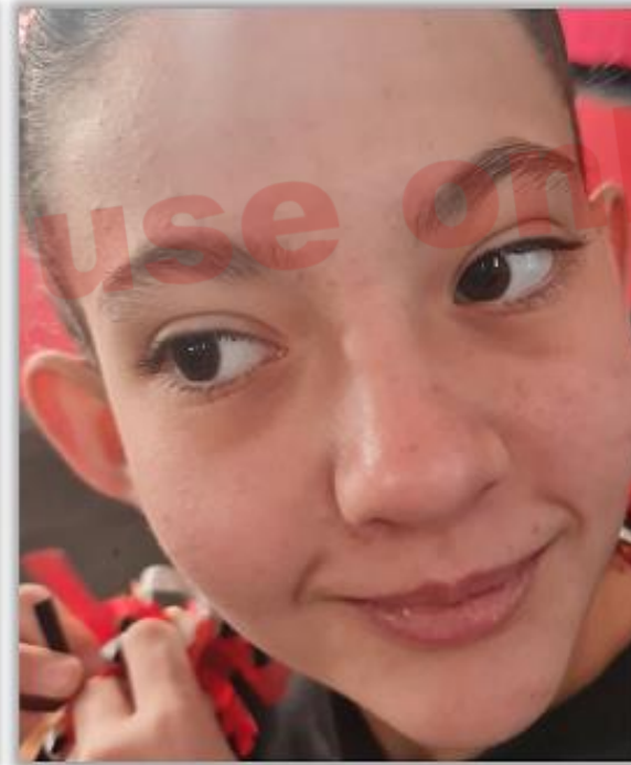
15 August 2023–28 August 2023